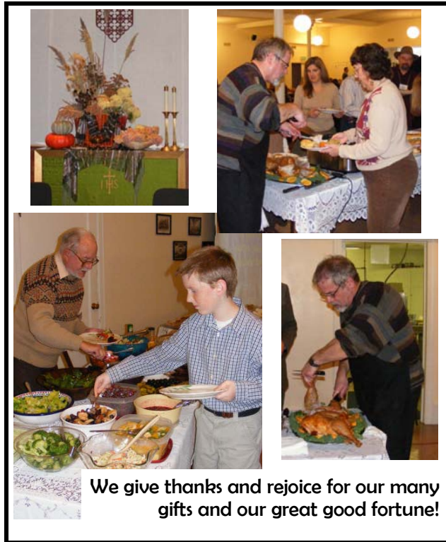
We give thanks and rejoice for our many gifts and our great good fortune!

resources in gratitude for what we have received and in turn to realize that we have enough and that our time here is well spent. We are asked to do this in a stressful climate, turning aside fear and doubt that shut God out. We are asked to accept the disturbing force of change that leads us out of our comfort zones to be developed more. We are asked to realistically support a ministry we believe in with the assurance that God is present in all things and that love, compassion and inclusion are the most powerful ways for us to express that belief.