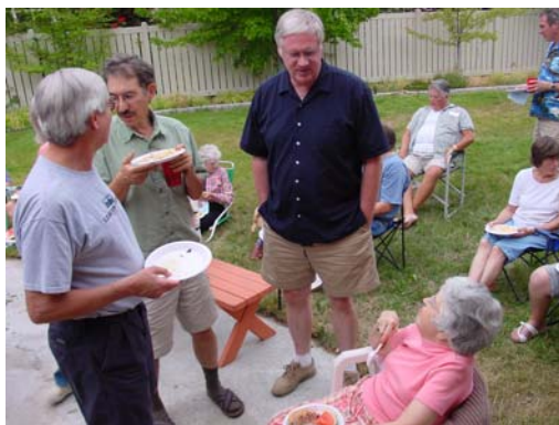
Pastors' Patio Party August 2008