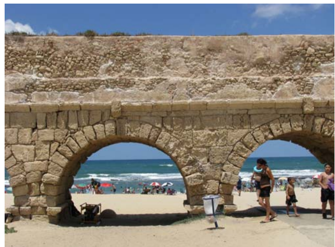
Roman Aqueducts, Caesarea Maritima