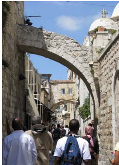
Via Dolorosa "The Mournful Way" Jerusalem