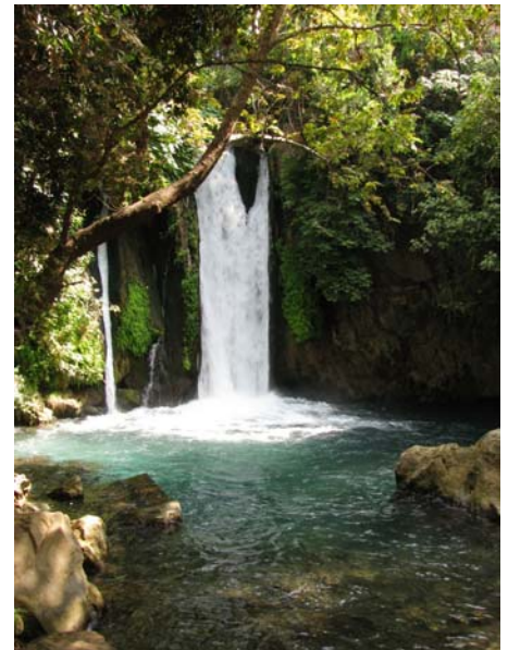
Headwaters of the Jordan Falls at Banias