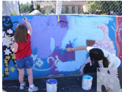
Graffiti painting in the alley June 2008