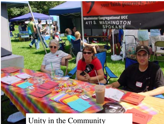
Unity in the Community August 2008