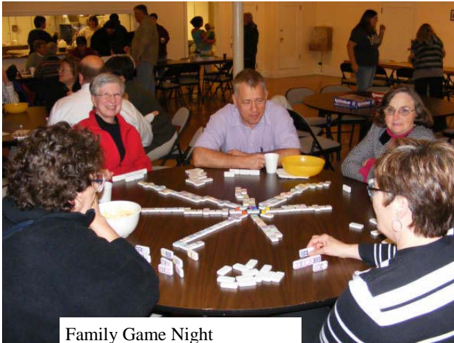
Family Game Night June 2008