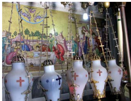
Church of the Holy Sepulchre, Jerusalem