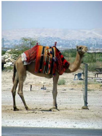
Camel in Jericho